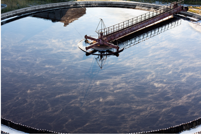
Fig. 8: Purification in tank by biological organisms