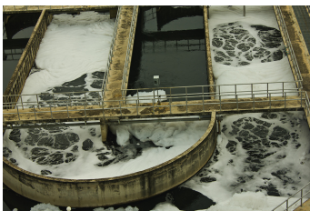
Fig. 9: Water recycling on sewage treatment station